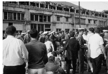
Roma Street: Police make the first arrests

The event was celebrated at the Brisbane Workers Community Centre, Pad-