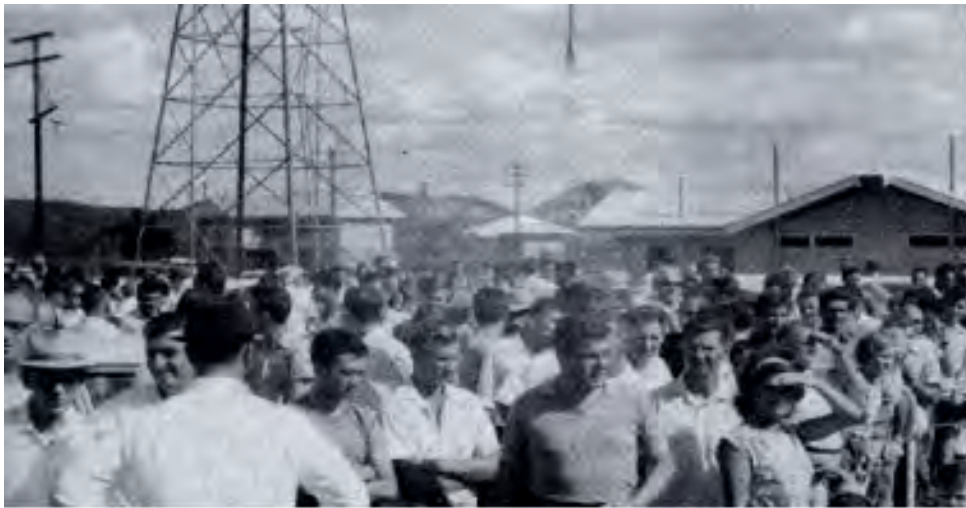
Mt Isa Strikers