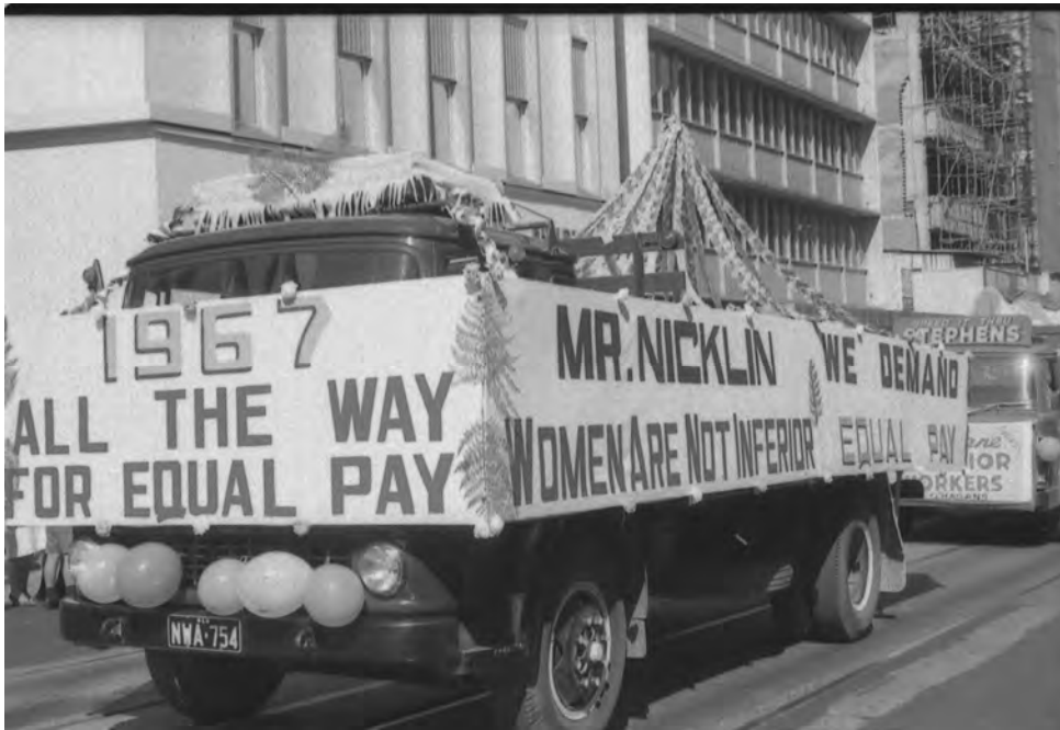
May Day 1967. Women's groups such as the UAW and the women's committees of militant trade unions were able to appeal for support from trade unions for such issues as equal pay.