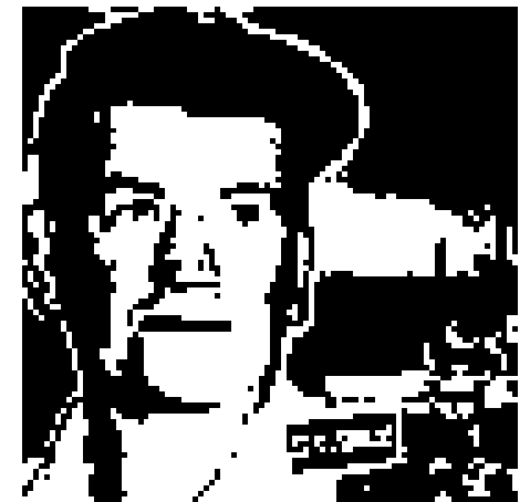
Poster for the play Red Cap