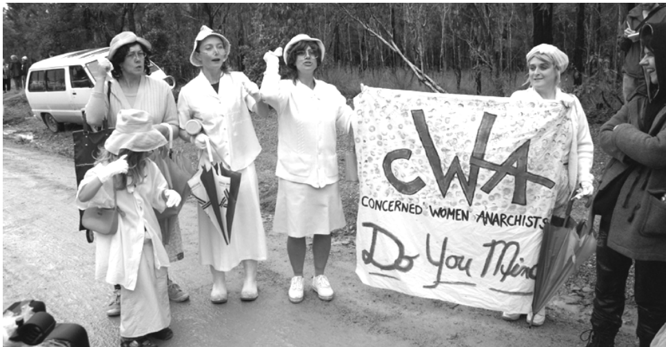
The CWA makes a point at the Talisman Saber protests, Central Queensland, 2007.