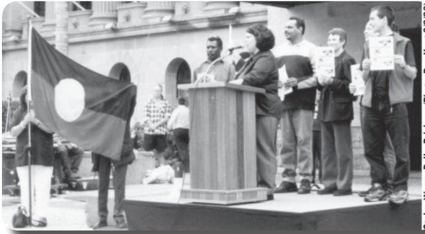
Stolen Wages Rally, Brisbane