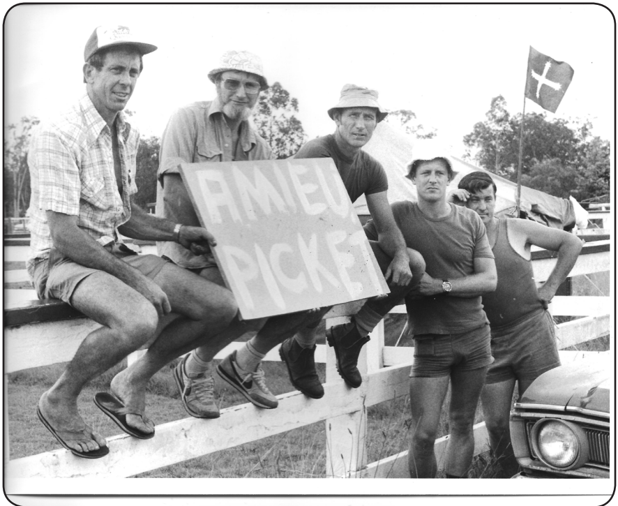
AMIEU Picket Line, TA Fields Meatworks, Early 1980s