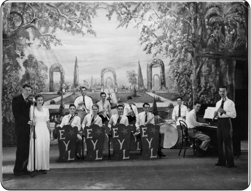
Eureka Youth League Concert Band at Albert Hall in 1945

of the Boilermakers Union. At the plant there were the AEU and the Sheetmetal Union. We had many disputes between them, which was bad for unity and we learned from hard lessons. We had a six week strike in the 60s to bring our wages up to those paid by the company in Sydney, but we were forced back to work by the courts.